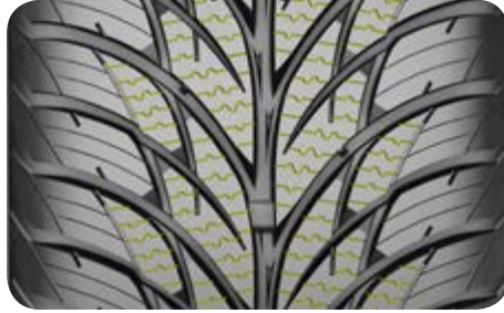
Short braking distances in winter

Large shoulder blocks increase tread pattern stiffness and reduce the deformation of the tyre for better power transmission in curves on dry road. This ensures perfect handling in the summer.