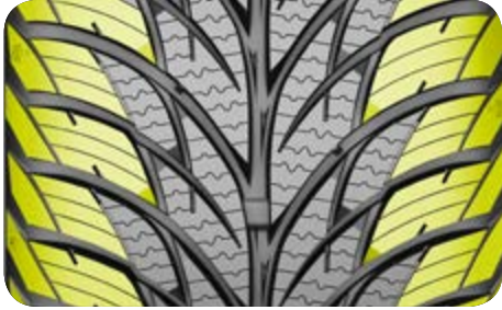
Perfect handling in summer

Perfect handling. Whatever the weather. 365 days a year.